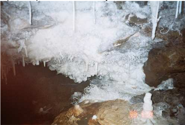
Heli beds in Daren Cilau.