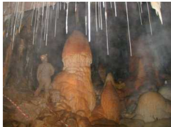
Hall of Thirty