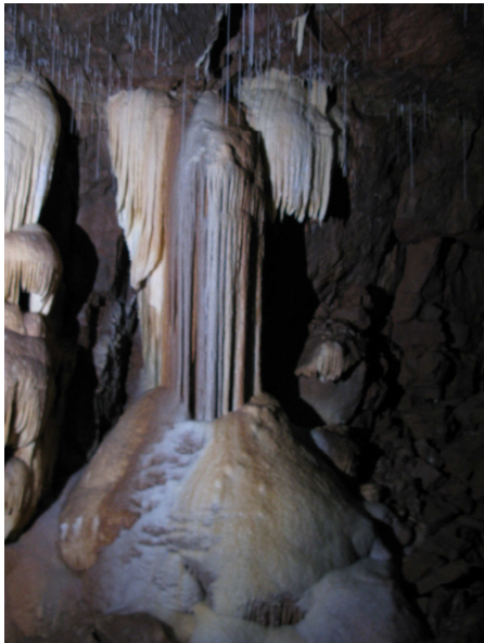
Formations in Otter Hole

The next section is quite hard work, lots of ups and downs, no walking. We went the wrong way very briefly at a junction - but our guide soon realised it was wrong, so we backtracked and found the turning to left.