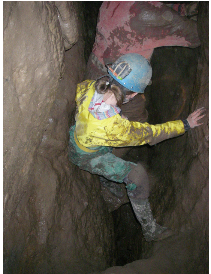
Scouts in Hilliers Cave.