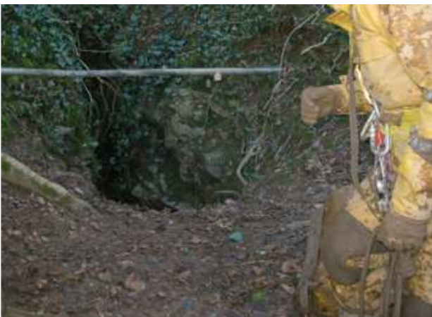
Mangle Hole entrance

So we met up and made our way to Rhino, however, just as we got to the pothole another group were just going in and doing the same route as we had planned so we decided not to shadow them in, but decided that we would go over to Mangle Hole and do that as an SRT trip instead. Walking back from Rhino we met another pair of cavers going to Rhino, it was a glorious sunny morning and the sunshine obviously brought out the cavers, they had been to Thrupe first but as there was water pouring in the main entrance and down the first shaft they decided to try Rhino instead. We parked at the Avon Ski centre with its various on lookers (before and after the trip) and then walked up the access road and across the side of the hill on the public footpath and just past Sandford Levy and slightly higher up we found Mangle Hole.