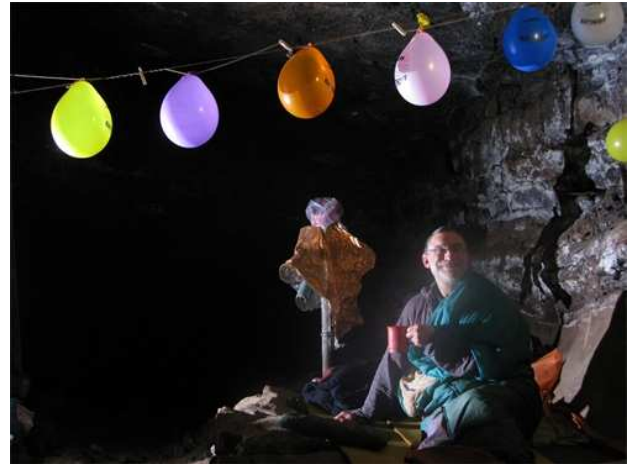
Birthday celebrations in Daren Cilau.

It was remarkable by the end of Saturday evening even after a few cocktails that we had four paraffin stoves working well and one Tilley lamp working exceptionally well while the other one was rather average. Any Tilley lamps out there please let us know.