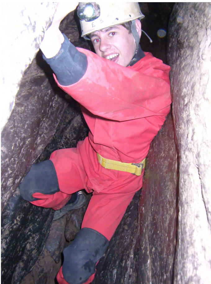
Scout caving day in Goatchurch Cavern.